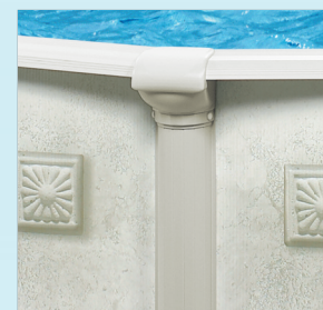
Ledge, cap and post designed for a secure fit