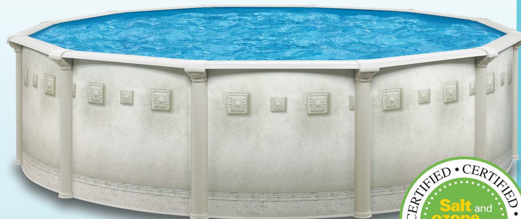
Round Kamika - Tuscan wall offered in 52 inches