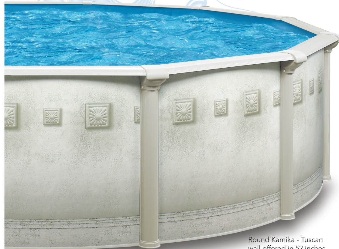
Round Kamika - Tuscan wall offered in 52 inches