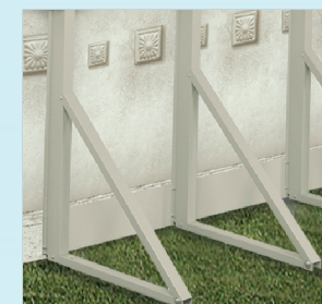
Heavy-duty angle brace system