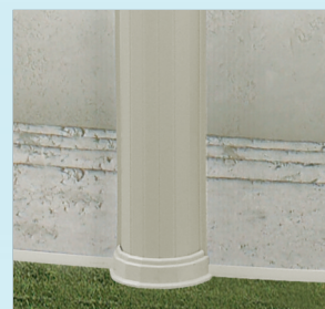
One-piece resin foot collar