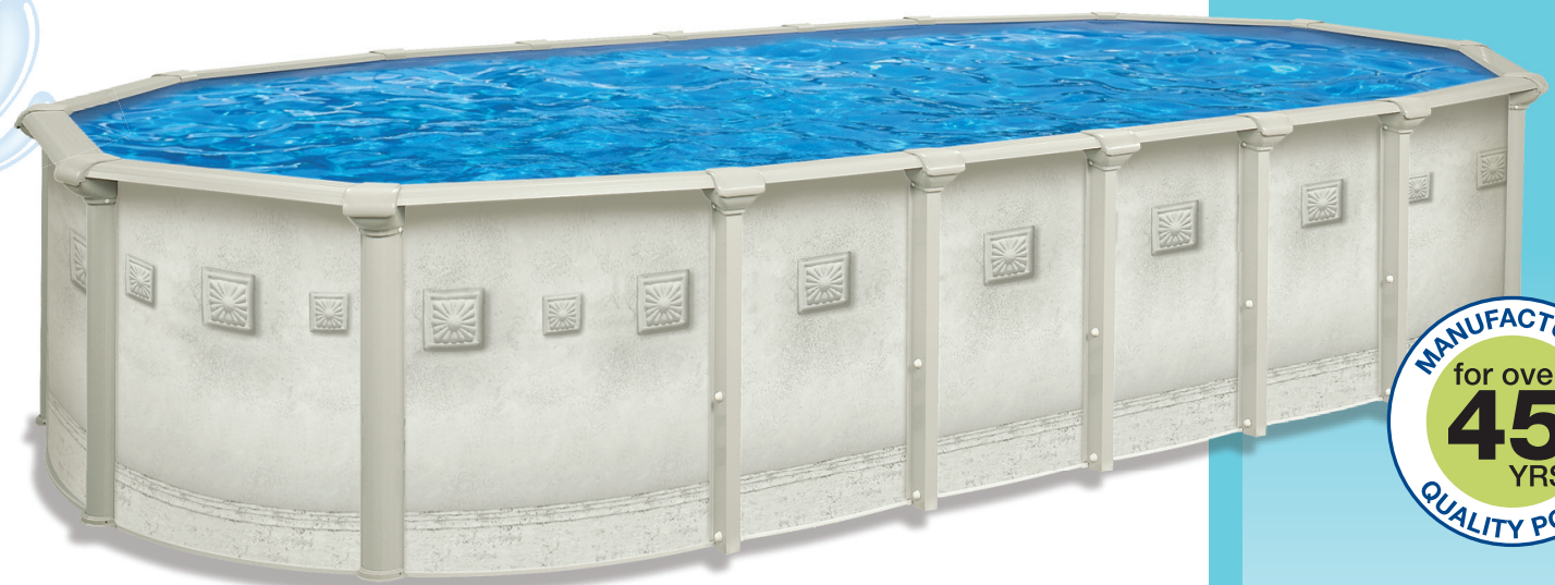
NBS oval Kamika - Tuscan wall offered in 52 inches

If you're handy with a screwdriver, then you can easily assemble your own Aquarian pool. We've designed each pool to make installation problem-free—no multi-sized washers or nuts to worry about. Just one large screw type is used to assemble the entire pool and we provide easy-to-follow instructions.